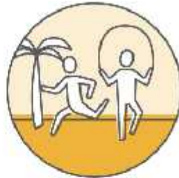
Our active, healthy city