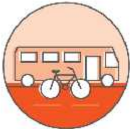
Our accessible, connected city