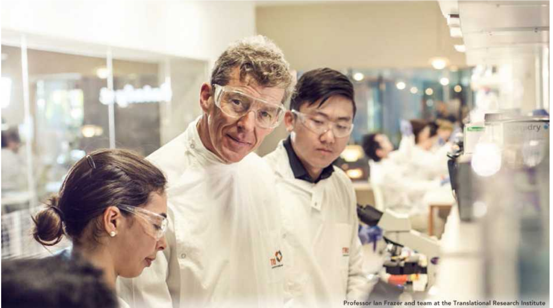
Professor Ian Frazer and team at the Translational Research Institute