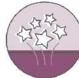
Our vibrant, creative city