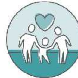
Our friendly, safe city