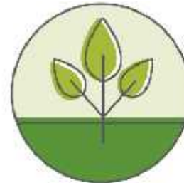
Our clean, green city