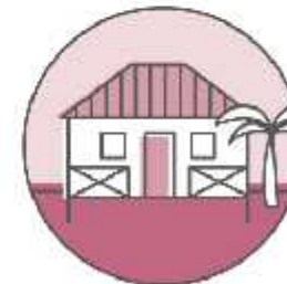
Our well-designed, subtropical city